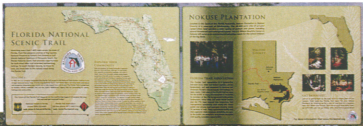
Longleaf Trail Hikers

Before ground was broken for the building, FTA and the USDA Forest Service recognized they shared the Center's goals of educating youth about the natural world and began a partnership with the Center and Nokuse Plantation to promote these values. The Center is located on the 49,000-acre Nokuse Plantation in south Walton County near Freeport. The Plantation's long term goal is to restore the longleaf pine/wiregrass ecosystem. A significant part of this process has been the relocation of large numbers of gopher tortoises and the restoration of habitat for black bears. The only public access to the Nokuse Plantation is the 25-mile section of the Florida National Scenic Trail which traverses the Plantation between the Choctawhatchee River and Eglin Air Force Base.